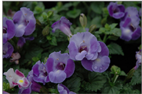
Blue Moon Torenia flowers

Blue Moon Torenia is recommended for the following landscape applications;