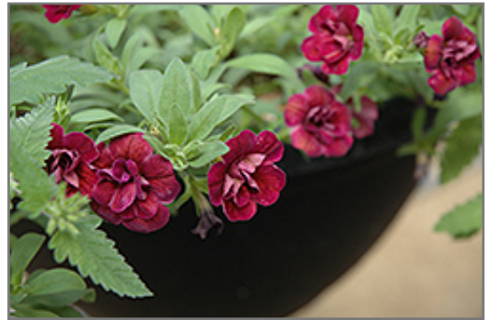
Superbells Double Plum Calibrachoa flowers

Superbells Double Plum Calibrachoa is recommended for the following landscape applications;