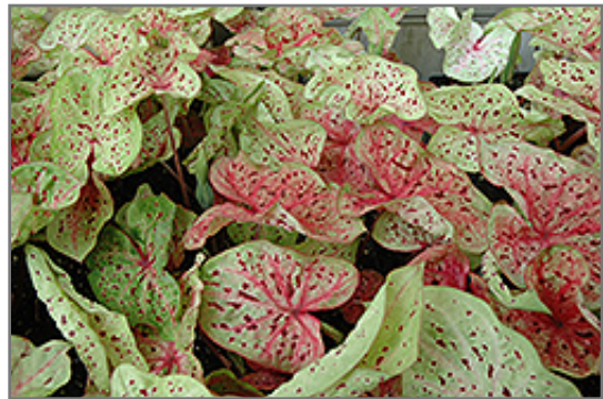
Miss Muffet Caladium foliage