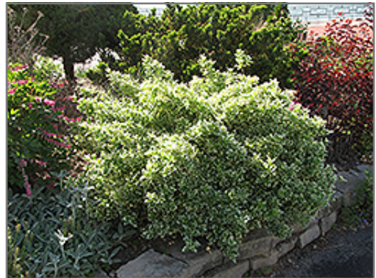
Emerald Gaiety Wintercreeper