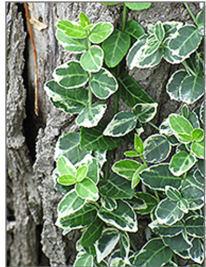
Emerald Gaiety Wintercreeper foliage

Emerald Gaiety Wintercreeper is recommended for the following landscape applications;