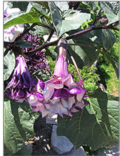
Purple Queen Devil's Trumpet flowers

Purple Queen Devil's Trumpet is recommended for the following landscape applications;