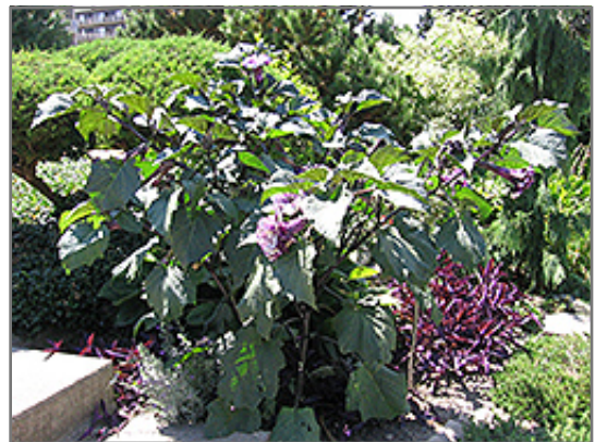
Purple Queen Devil's Trumpet in bloom