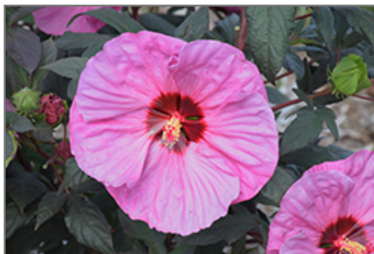
Summerific Berry Awesome Hibiscus flowers

Summerific Berry Awesome Hibiscus is recommended for the following landscape applications;