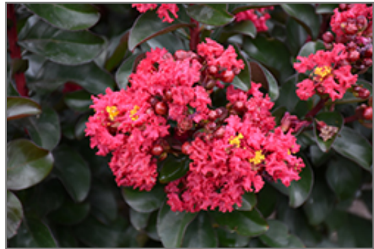
Cherry Mocha Crapemyrtle flowers

Cherry Mocha Crapemyrtle is recommended for the following landscape applications;