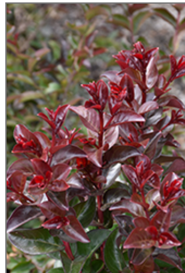
Cherry Mocha Crapemyrtle foliage

Cherry Mocha Crapemyrtle makes a fine choice for the outdoor landscape, but it is also well-suited for use in outdoor pots and containers. With its upright habit of growth, it is best suited for use as a 'thriller' in the 'spiller-thriller-filler' container combination; plant it near the center of the pot, surrounded by smaller plants and those that spill over the edges. It is even sizeable enough that it can be grown alone in a suitable container. Note that when grown in a container, it may not perform exactly as indicated on the tag - this is to be expected. Also note that when growing plants in outdoor containers and baskets, they may require more frequent waterings than they would in the yard or garden.