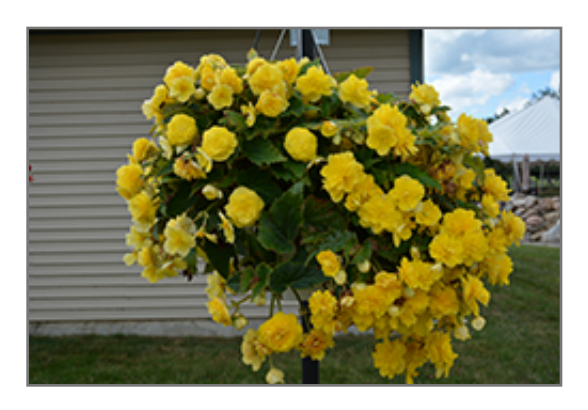
Nonstop Joy Yellow Begonia in bloom