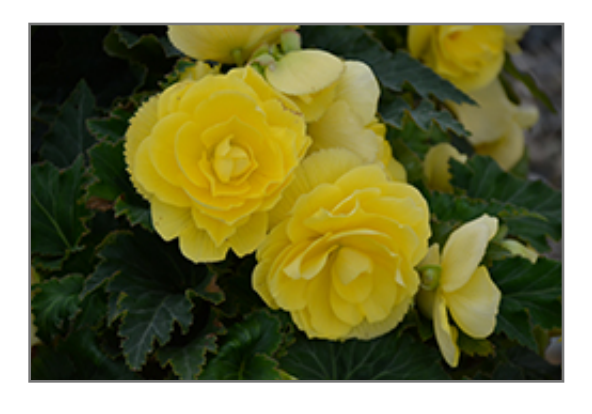
Nonstop Joy Yellow Begonia flowers