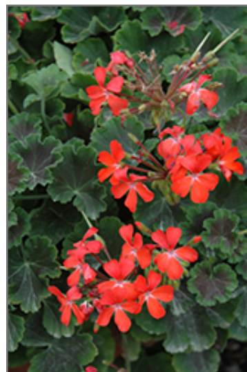
Brocade Dark Fire Geranium flowers