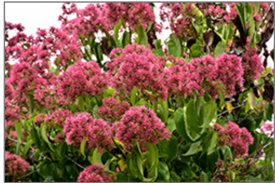
Temple Of Bloom Seven-Son Flower flowers