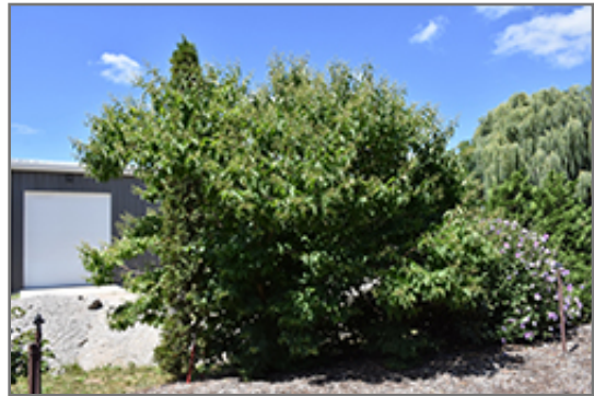
Temple Of Bloom Seven-Son Flower