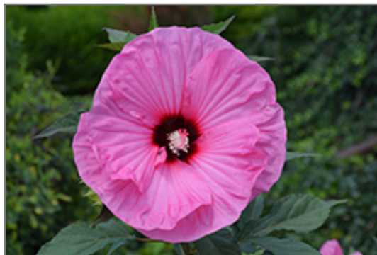
Summerific Candy Crush Hibiscus flowers

This plant will require occasional maintenance and upkeep, and should be cut back in late fall in preparation for winter. It is a good choice for attracting butterflies and hummingbirds to your yard. Gardeners should be aware of the following characteristic(s) that may warrant special consideration;