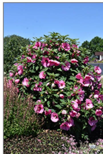
Summerific Candy Crush Hibiscus in bloom