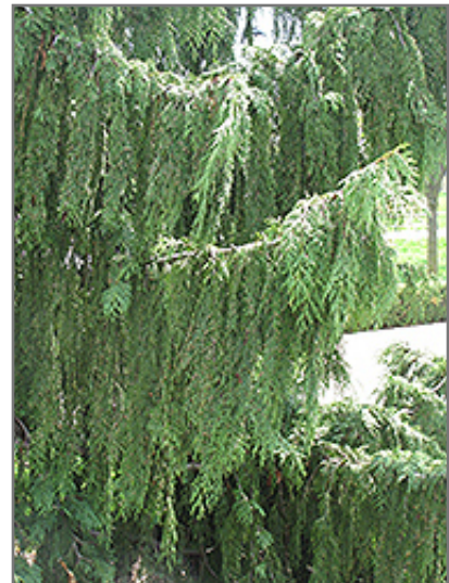
Nootka Cypress foliage