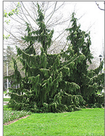
Nootka Cypress