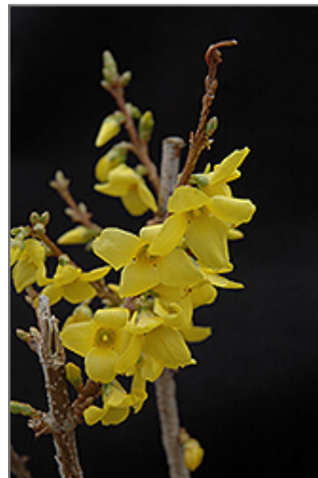
Show Off Forsythia flowers

* This is a 'special order' plant - contact store for details