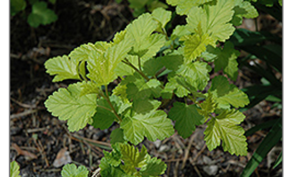
Common Ninebark foliage

Common Ninebark features showy cymes of white flowers at the ends of the branches from late spring to early summer. It has green deciduous foliage. The serrated lobed leaves turn an outstanding coppery-bronze in the fall. It produces red capsules from early to mid fall. The peeling tan bark adds an interesting dimension to the landscape.