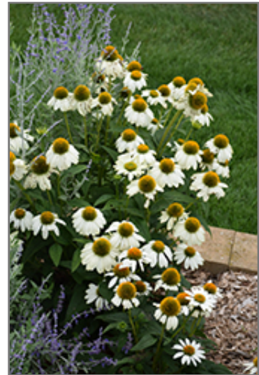
PowWow White Coneflower in bloom