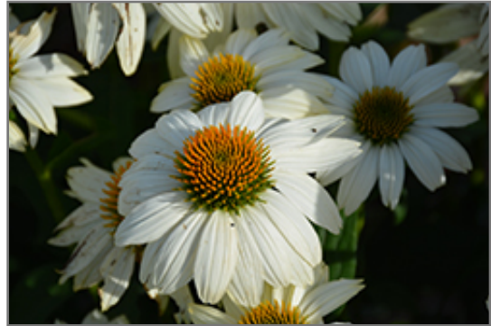
PowWow White Coneflower flowers

This is a relatively low maintenance plant, and is best cleaned up in early spring before it resumes active growth for the season. It is a good choice for attracting birds and butterflies to your yard, but is not particularly attractive to deer who tend to leave it alone in favor of tastier treats. It has no significant negative characteristics.