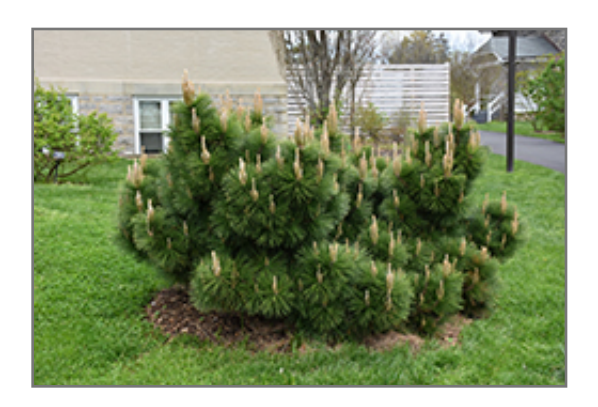
Thunderhead Japanese Black Pine

Thunderhead Japanese Black Pine is recommended for the following landscape applications;