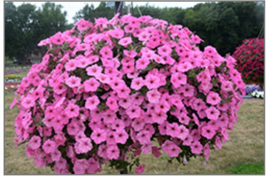
Supertunia Vista Bubblegum Petunia in bloom

Supertunia Vista Bubblegum Petunia is a fine choice for the garden, but it is also a good selection for planting in outdoor containers and hanging baskets. Because of its trailing habit of growth, it is ideally suited for use as a 'spiller' in the 'spiller-thriller-filler' container combination; plant it near the edges where it can spill gracefully over the pot. Note that when growing plants in outdoor containers and baskets, they may require more frequent waterings than they would in the yard or garden.