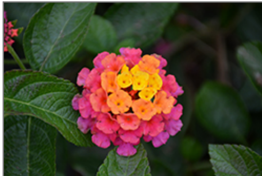
Lucky Sunrise Rose Lantana flowers

Lucky Sunrise Rose Lantana is recommended for the following landscape applications;