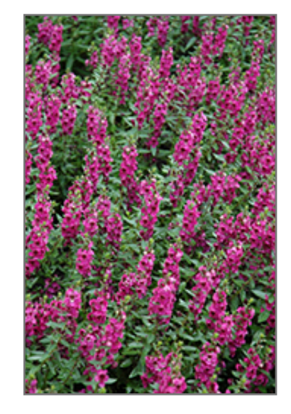
Archangel Raspberry Angelonia flowers