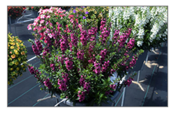
Archangel Raspberry Angelonia in bloom