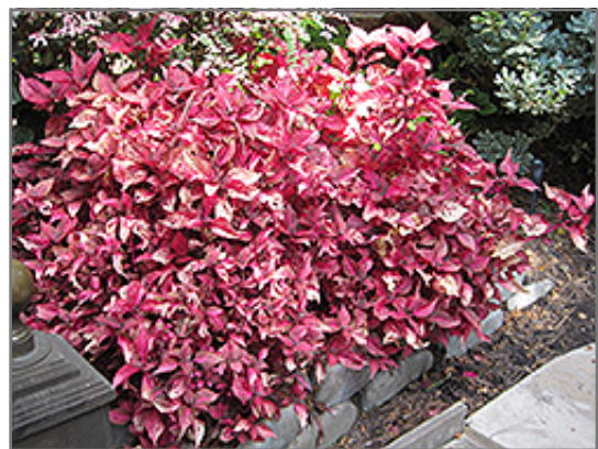
Blood Leaf