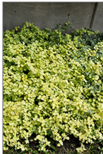
Lemon Licorice Plant