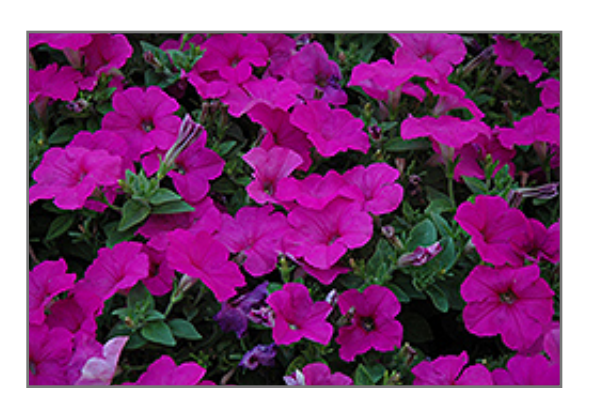
Easy Wave Neon Rose Petunia flowers