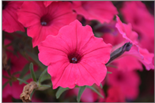
Supertunia Vista Fuchsia Petunia flowers