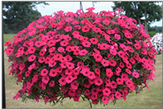
Supertunia Vista Fuchsia Petunia in bloom