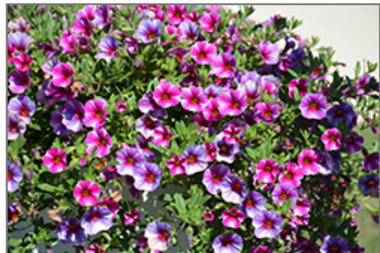
Can-Can Hot Pink Star Calibrachoa flowers