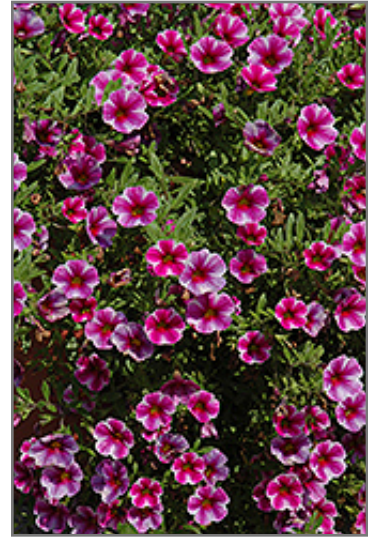
Can-Can Hot Pink Star Calibrachoa flowers

Can-Can Hot Pink Star Calibrachoa is recommended for the following landscape applications;