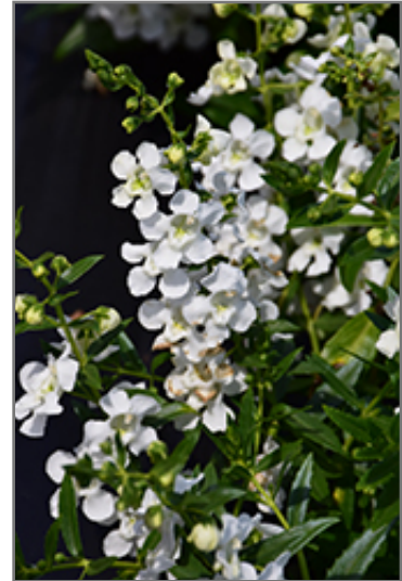
AngelMist Spreading White Angelonia flowers

This plant will require occasional maintenance and upkeep, and should not require much pruning, except when necessary, such as to remove dieback. It is a good choice for attracting butterflies to your yard, but is not particularly attractive to deer who tend to leave it alone in favor of tastier treats. It has no significant negative characteristics.