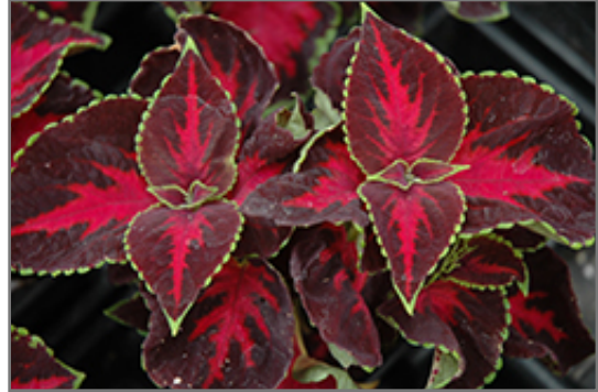
Chocolate Covered Cherry Coleus foliage