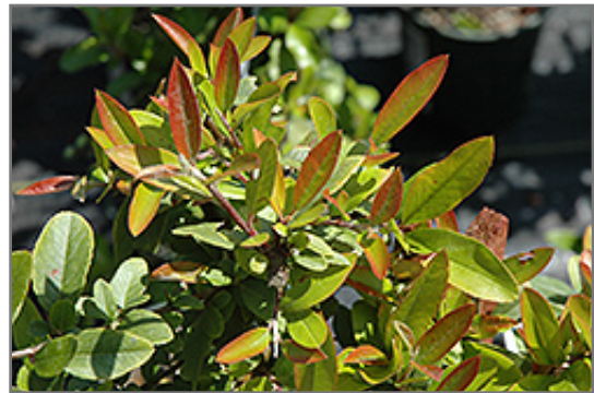
Orange Glow Scarlet Firethorn foliage