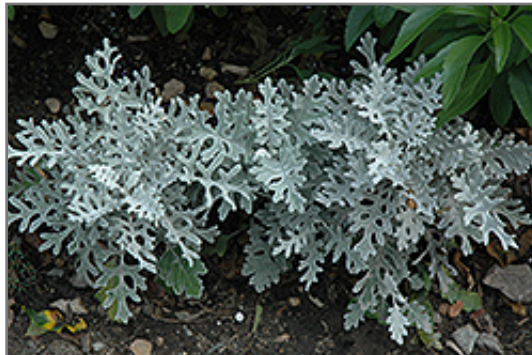
Silver Dust Dusty Miller foliage