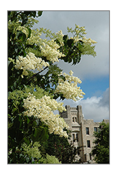
Ivory Silk Japanese Tree Lilac flowers