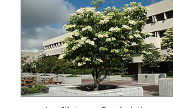
Ivory Silk Japanese Tree Lilac in bloom