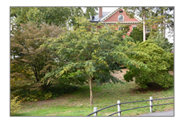
E.H. Wilson Mimosa