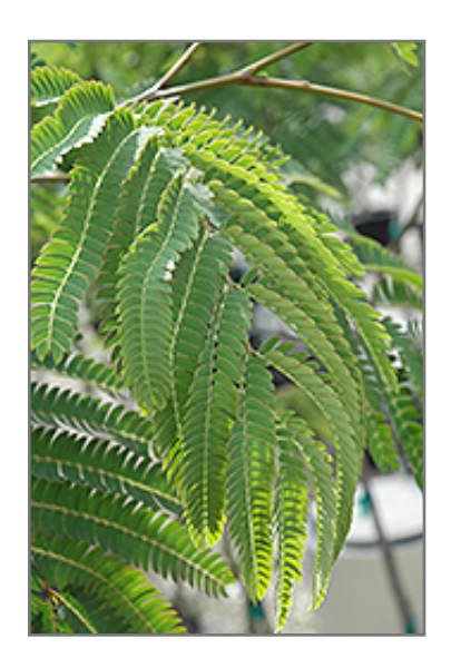
E.H. Wilson Mimosa foliage

This tree should only be grown in full sunlight. It is very adaptable to both dry and moist growing conditions, but will not tolerate any standing water. It is not particular as to soil type or pH, and is able to handle environmental salt. It is highly tolerant of urban pollution and will even thrive in inner city environments. This is a selected variety of a species not originally from North America.