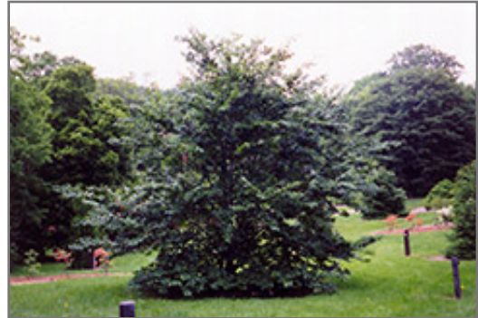
American Beech