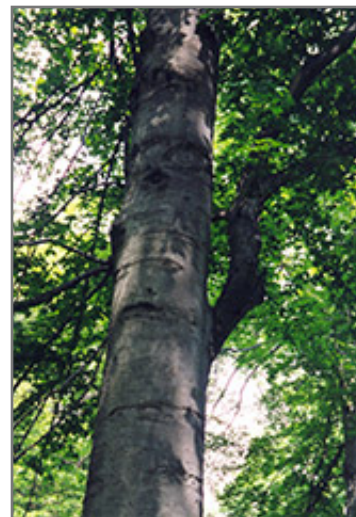
American Beech bark

* This is a 'special order' plant - contact store for details