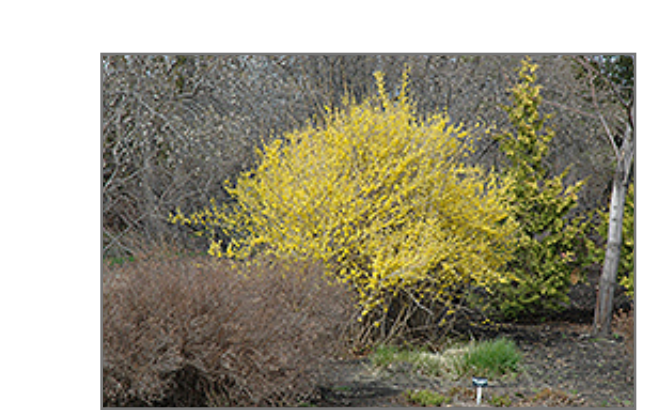
Northern Gold Forsythia in bloom

Northern Gold Forsythia is recommended for the following landscape applications;