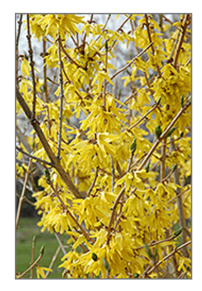
Northern Gold Forsythia flowers