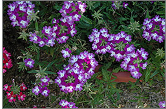
Lanai Twister Purple Verbena flowers

This plant will require occasional maintenance and upkeep. Trim off the flower heads after they fade and die to encourage more blooms late into the season. Deer don't particularly care for this plant and will usually leave it alone in favor of tastier treats. It has no significant negative characteristics.