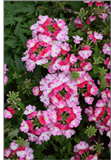
Lanai Twister Red Verbena flowers

Lanai Twister Red Verbena is recommended for the following landscape applications;