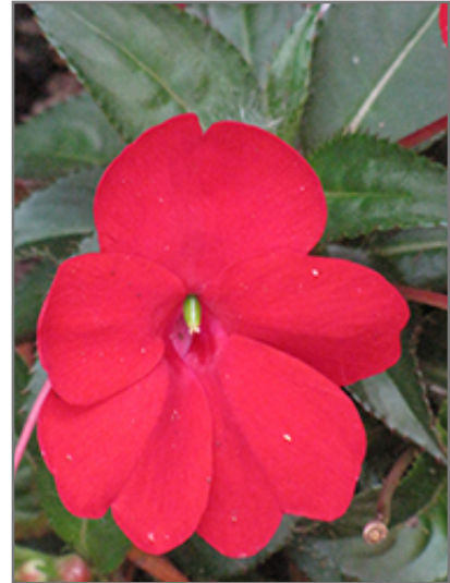
SunPatiens Compact Red New Guinea Impatiens flowers

This plant will require occasional maintenance and upkeep, and should not require much pruning, except when necessary, such as to remove dieback. It is a good choice for attracting bees and butterflies to your yard. It has no significant negative characteristics.