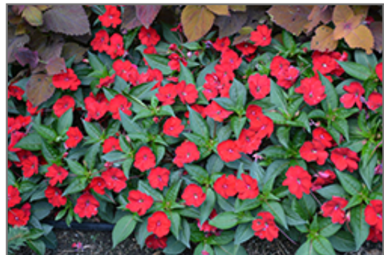
SunPatiens Compact Red New Guinea Impatiens in bloom