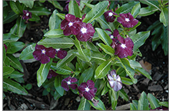
Jams 'N Jellies Blackberry Vinca flowers