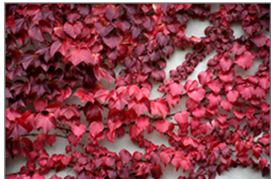
Veitch Boston Ivy in fall