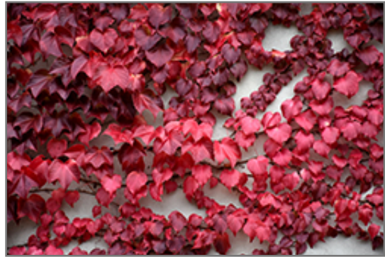
Veitch Boston Ivy in fall