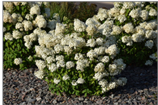
Bobo Hydrangea in bloom