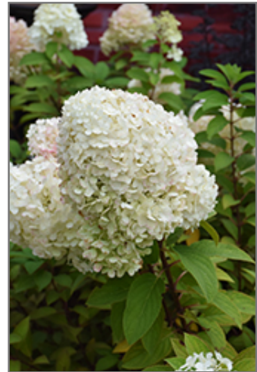
Bobo Hydrangea flowers