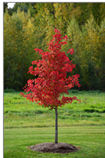
Wildfire Black Gum in fall