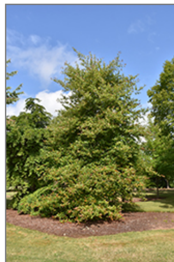
Wildfire Black Gum