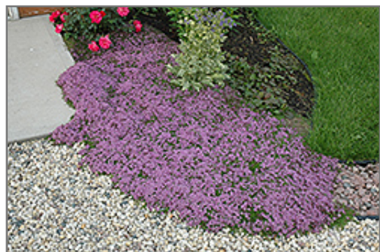
Red Creeping Thyme in bloom