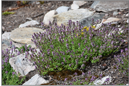
Lemon Thyme in bloom

This plant is quite ornamental as well as edible, and is as much at home in a landscape or flower garden as it is in a designated herb garden. It should only be grown in full sunlight. It prefers to grow in average to dry locations, and dislikes excessive moisture. It is considered to be drought-tolerant, and thus makes an ideal choice for a low-water garden or xeriscape application. It is not particular as to soil type or pH. It is highly tolerant of urban pollution and will even thrive in inner city environments. Consider covering it with a thick layer of mulch in winter to protect it in exposed locations or colder microclimates. This particular variety is an interspecific hybrid. It can be propagated by division; however, as a cultivated variety, be aware that it may be subject to certain restrictions or prohibitions on propagation.