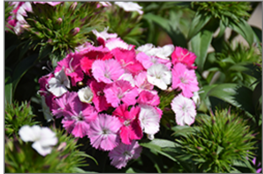
Amazon Rose Magic Pinks flowers

Amazon Rose Magic Pinks is recommended for the following landscape applications;