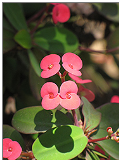
Crown Of Thorns flowers

Crown Of Thorns is recommended for the following landscape applications;