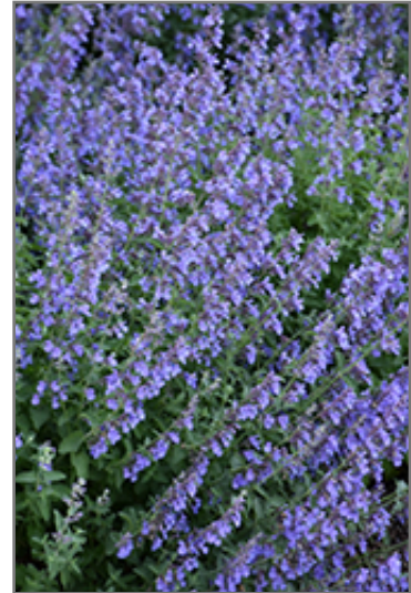
Cat's Meow Catmint flowers

Cat's Meow Catmint is recommended for the following landscape applications;