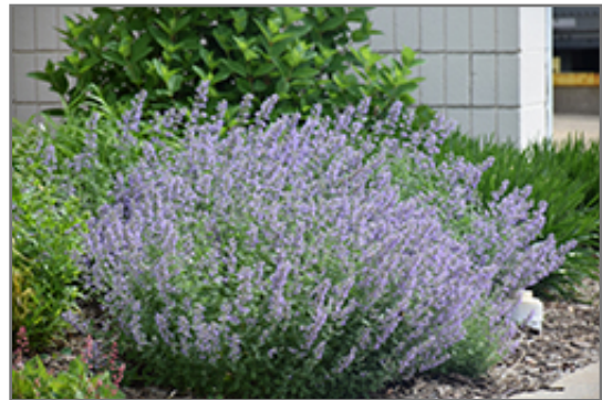
Cat's Meow Catmint in bloom