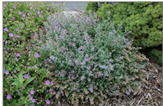
Cat's Meow Catmint in bloom