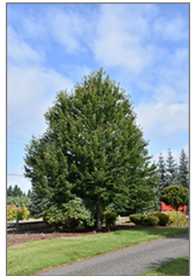
Redpointe Red Maple