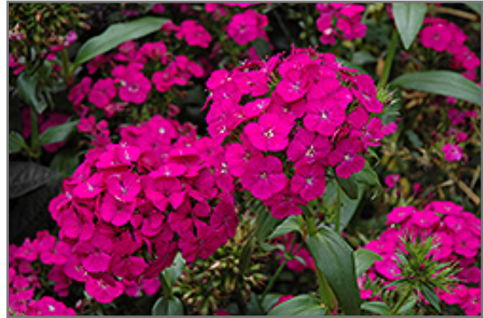
Amazon Neon Purple Pinks flowers

Amazon Neon Purple Pinks is recommended for the following landscape applications;