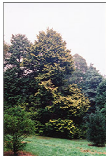
Golden Hinoki Falsecypress