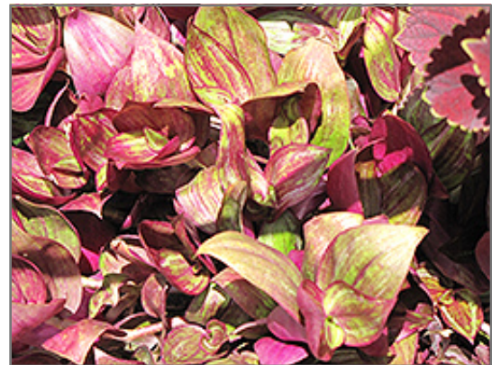
Purple Wandering Jew foliage