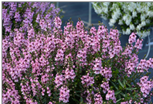
Serenita Pink Angelonia in bloom