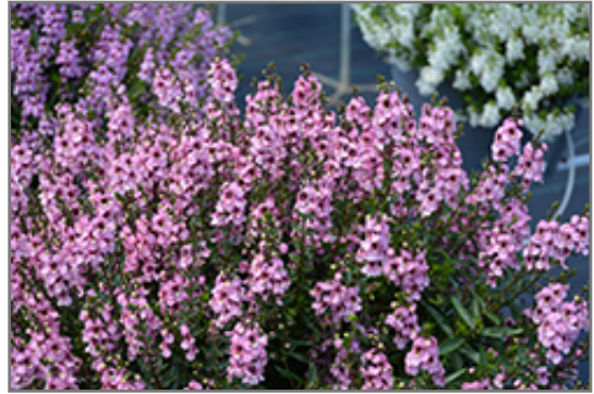
Serenita Pink Angelonia in bloom