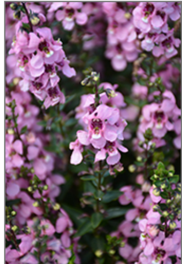
Serenita Pink Angelonia flowers