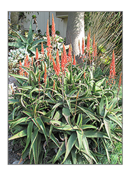
Aloe Vera in bloom

This plant should only be grown in full sunlight. It prefers dry to average moisture levels with very well-drained soil, and will often die in standing water. It is considered to be drought-tolerant, and thus makes an ideal choice for a low-water garden or xeriscape application. It is not particular as to soil pH, but grows best in sandy soils. It is somewhat tolerant of urban pollution. This species is not originally from North America. It can be propagated by division.