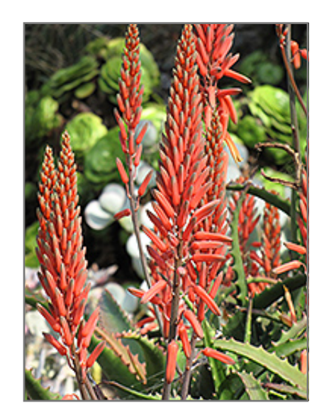
Aloe Vera flowers

This is a relatively low maintenance plant, and usually looks its best without pruning, although it will tolerate pruning. Deer don't particularly care for this plant and will usually leave it alone in favor of tastier treats. Gardeners should be aware of the following characteristic(s) that may warrant special consideration;